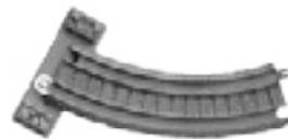
D Ascending Curve (Right) x 2